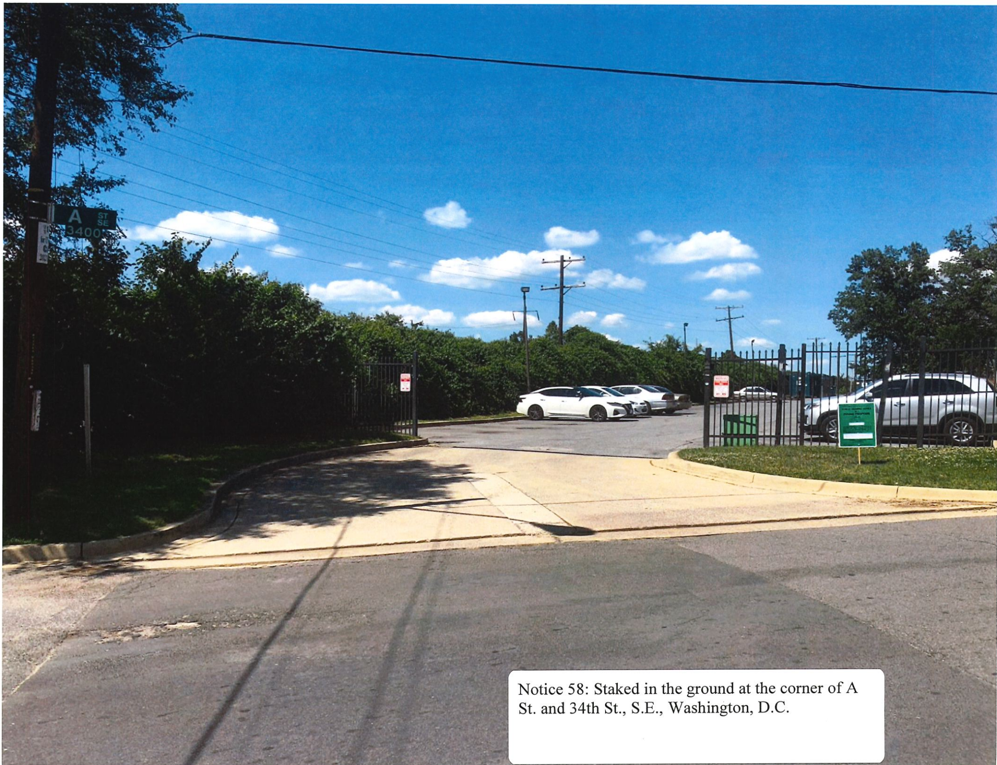
Notice 58: Staked in the ground at the corner of A St. and 34th St., S.E., Washington, D.C.