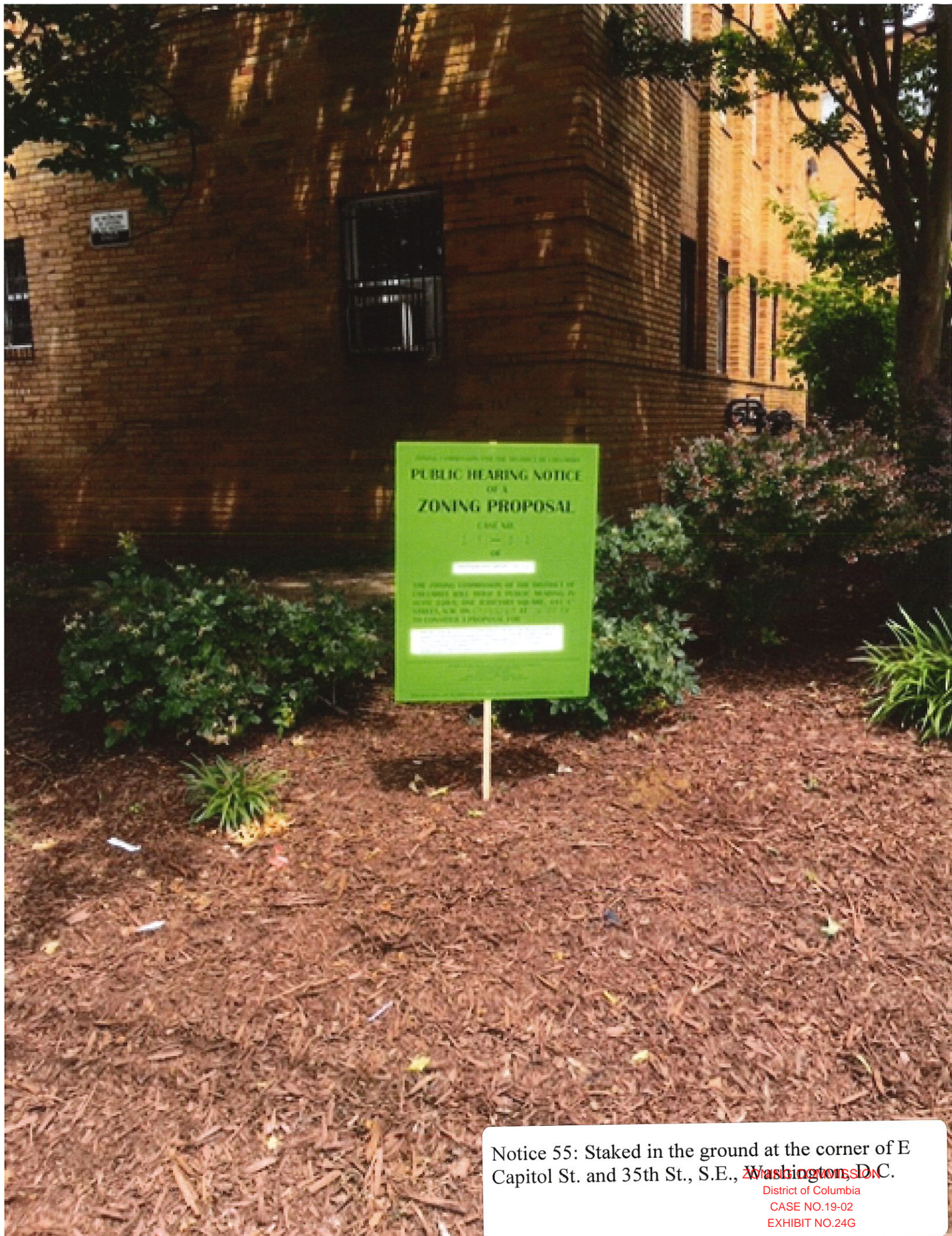
Notice 55: Staked in the ground at the corner of E Capitol St. and 35th St., S.E., Washington, D.C.

District of Columbia CASE NO.19-02 EXHIBIT NO.24G