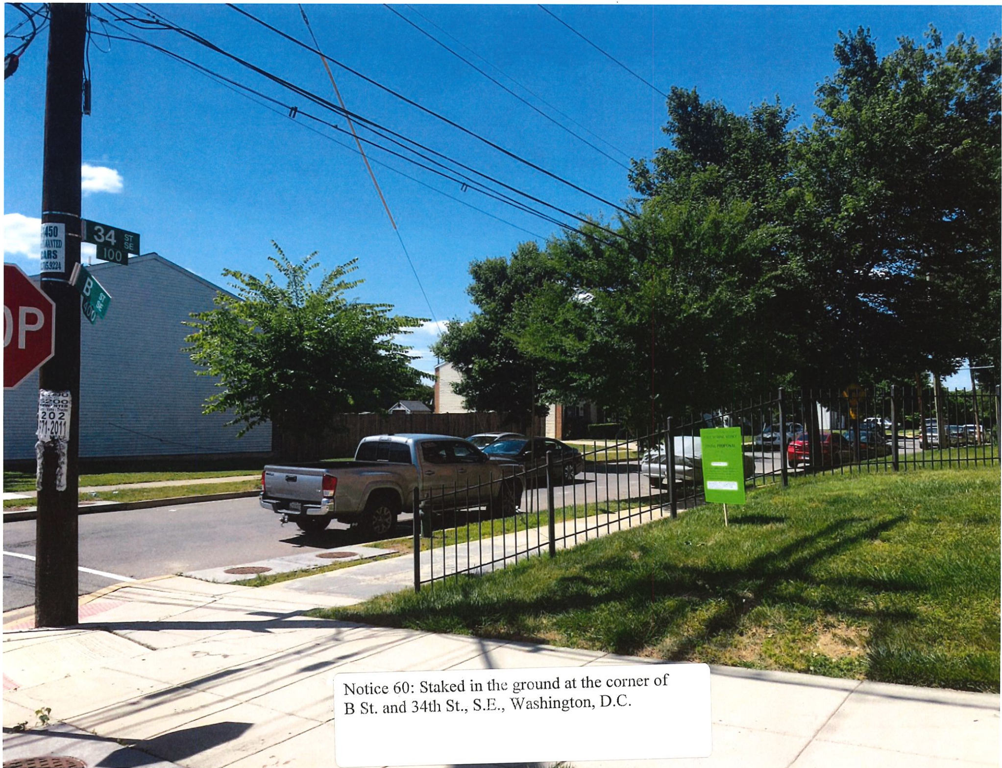
Notice 60: Staked in the ground at the corner of B St. and 34th St., S.E., Washington, D.C.