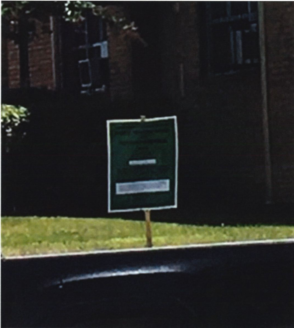
Notice 61: Staked in the ground at the corner of B St. and 35th St., S.E., Washington, D.C.